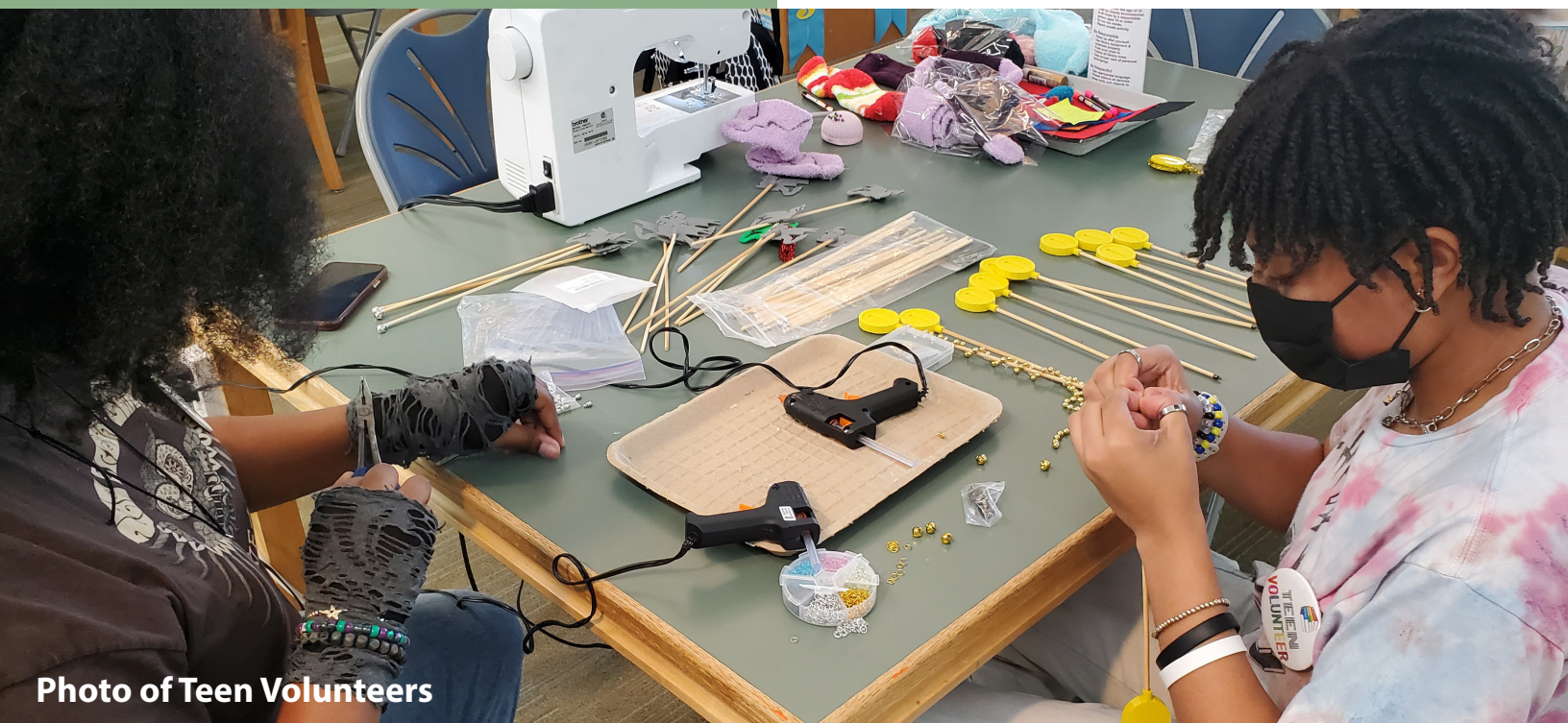
Photo of Teen Volunteers