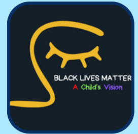
Black History Page 5

Come see a sentimental play about what it means to love and what it means to be real.