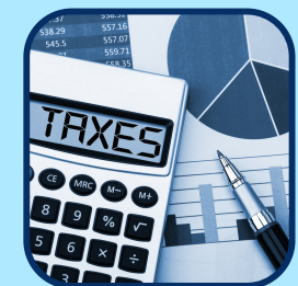
AARP Taxes Page 6