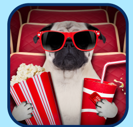
Kids Movies Page 2