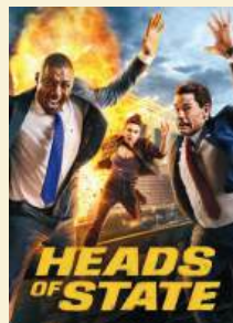
Heads of State April 23