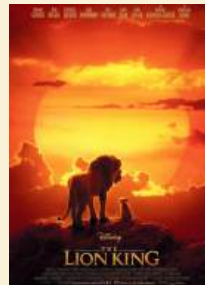
The Lion King April 2