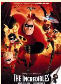
The Incredibles April 16