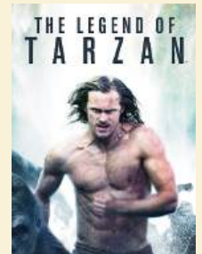
The Legend of Tarzan April 9