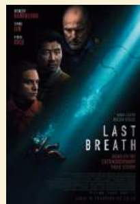
Last Breath May 14